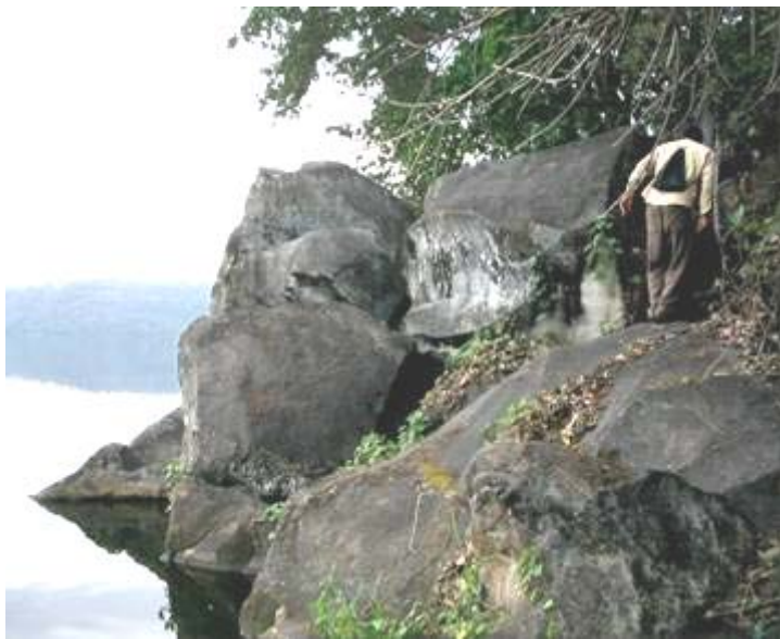
The invisible giant on the track to Nandasmo beach.